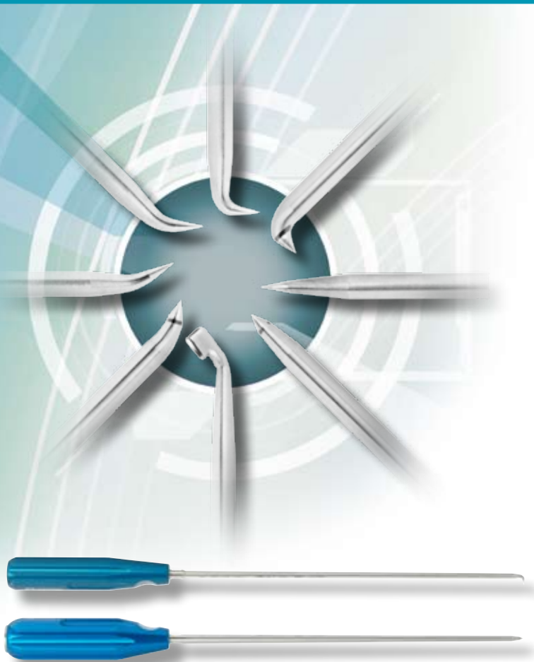
Microfracture Instrumentation Set

Designed to create microfractures in subchondral bone, available in 0, 30, 45 and 90 degree tip configurations. Features a strike plate on the proximal end and 3mm depth markings on the distal end (approximate depth needed to create local micro-fractures). Angled shaft heavy awl also available to facilitate access to difficult to reach areas.