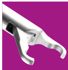
Suture Retrieval Forceps ■ Straight