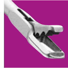
Aggressor Forceps ■ 15° Up ■ 15° Left ■ 15° Right