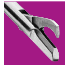
Micro Scissors ■ Straight