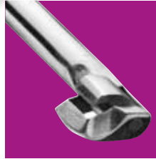
90° Rotary Forceps ■ Blunt Tip Right ■ Blunt Tip Left