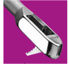
Retrograde Forceps ■ 15° Right Bite