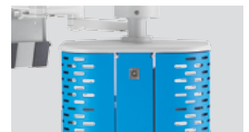
HD-SDI output on the rear spine