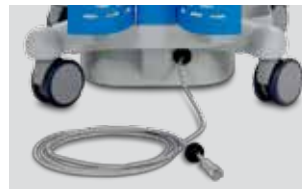
Built in isolation transformer and cord reel