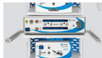
Optional 17" wide shelf for shaver or pump consoles